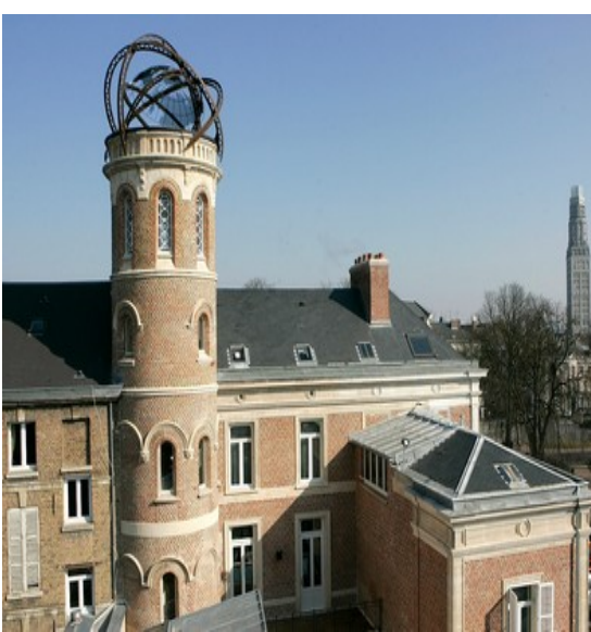
Jules Verne's home,1 rue Charles Dubois, Amiens. Interesting tower. Do the arches represent planet orbits, or what? It's now a museum said to be well worth a visit.

For me, the adventures around doing this film lead me to a long interest in amateur short films. Because of our film project I went to the Film and Video