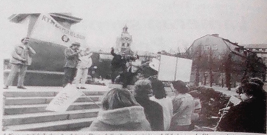
1 Kungsträdgården bedriver Rymdrörelsen opinionsbildning och filmproduktion på samma gång