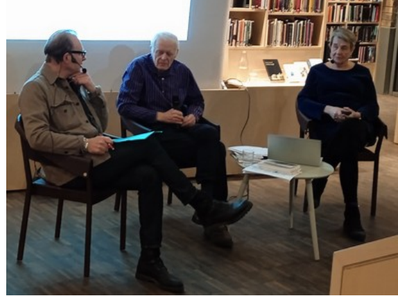
Holocaust panel. Former UN human rights commissoner Hammarberg in the middle

fan base in Sweden. The hall was more than packed. I had to sit far back in a window niche. It was quite interesting. I for instance noted his rather strange writing