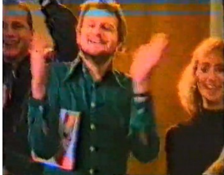
Big celebrations as the mighty Space Movement protests free Hacke. Here's me clapping hands in joy!

will now finish with pictures from the the great Jules Verne, now made into a museum in the